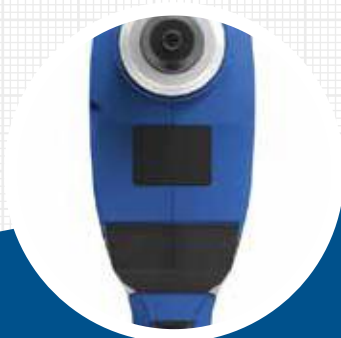
Optional integrated scanner (2021)