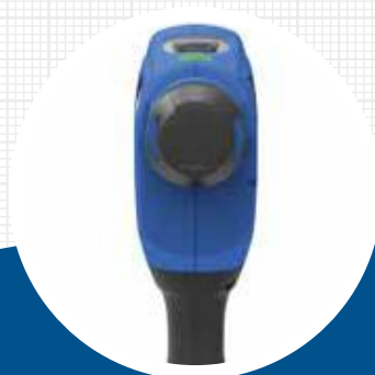
Lean housing form – only 71 mm wide!