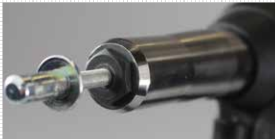
Eminently suitable for FERRO® BULB blind rivets!